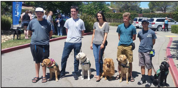
Pondo Pups Cutie, Andes, Thayer, Pittsburgh and Lazor with their trainers

This summer, Guide Dogs for the Blind (GDB) turned into a circus! With a carnival theme, GDB’s annual Fun Days on both campuses featured midway games, seminars under the “big top,” and of course, the most adorable sideshow in the world: puppy deliveries! The events gave GDB the opportunity to celebrate their 75th anniversary while thanking their volunteer puppy raisers for all they do to support their mission. Pondo Pup, Pittsburgh, was reunited with some of his siblings while King was reunited with his dad, Timothy. Pondo Pup, Thayer, dressed as a lion and got to see his parents and littermates again. It was a successful event with hundreds of well-behaved Guide Dogs.