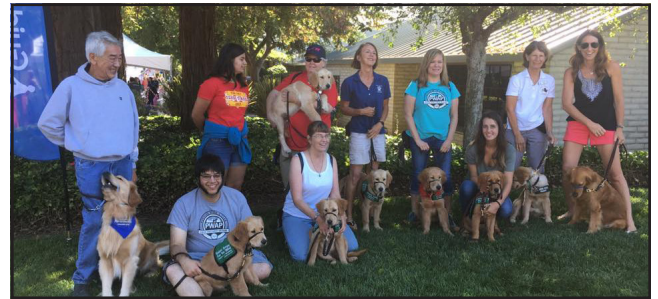
All had fun at the Guide Dogs for the Blind FUN DAY!