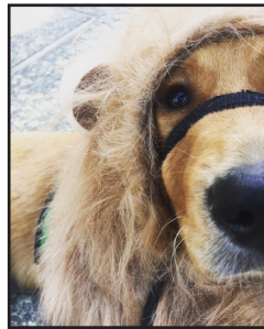
Pondo Pup, Thayer, dressed up as a lion