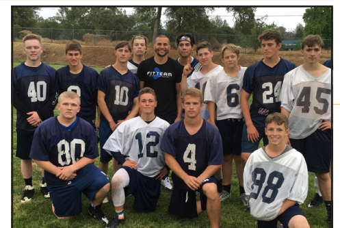
UMHS Football Players with Lance Moore